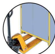
Pedestal area under-driveable by a forklift