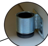
Adjustable leveling feet